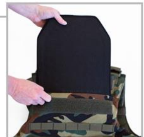
Hard armour plates