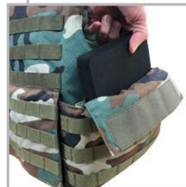
Side armour plates

*Weights and measures subject to manufacturers tolerances. Terms and conditions apply